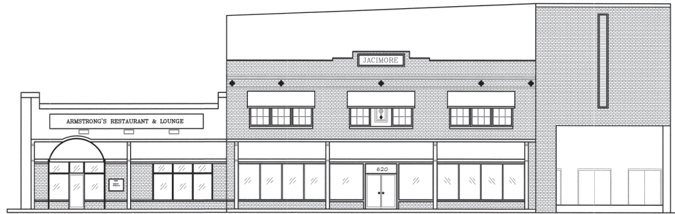
1 FRONT ELEVATION SCALE: 1/8"=1'-0"